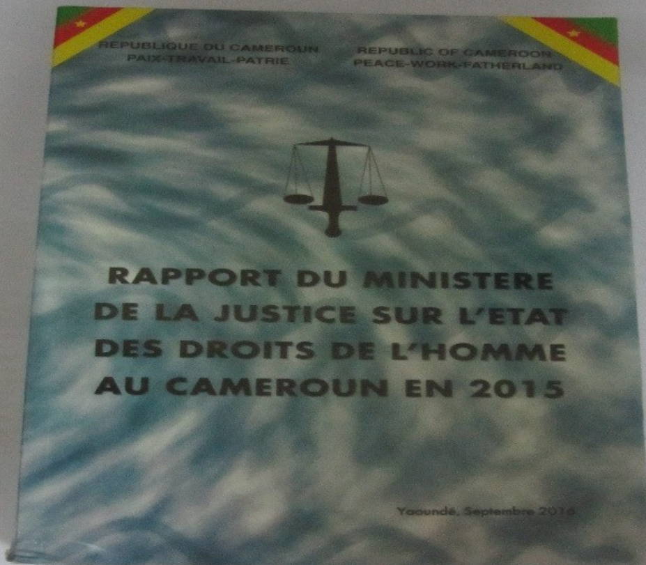
The printed copy of the report on Human Rights in the State is available at the Ministry of Justice, Yaoundé, Cameroon.